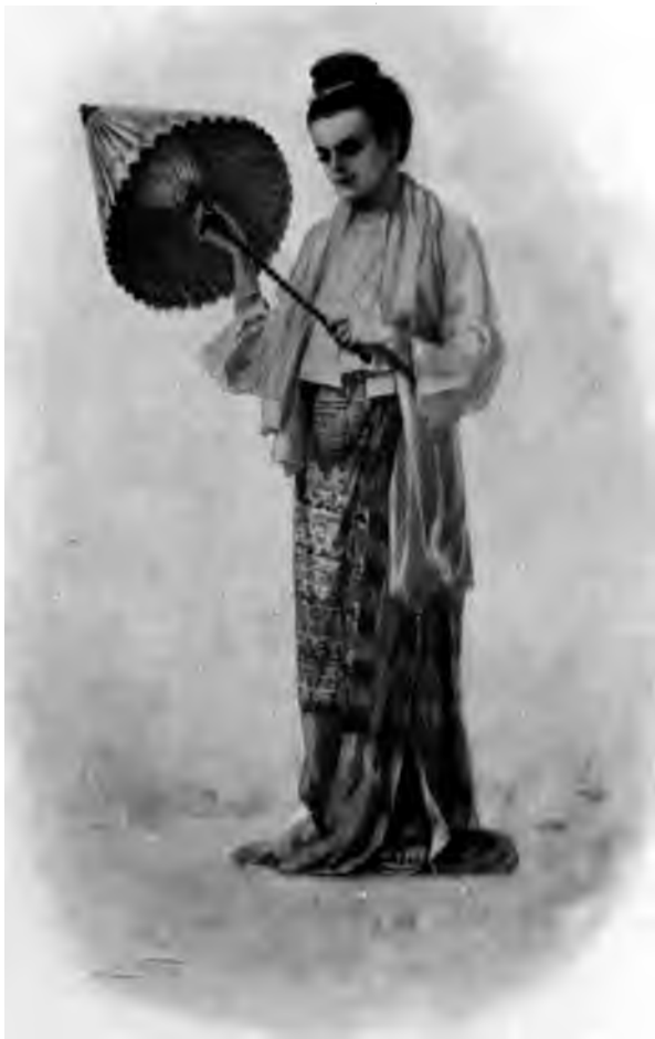
A DAINILY-GLAD BURMESE LADY. Page 8.